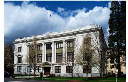
The Oregon Supreme Court Building