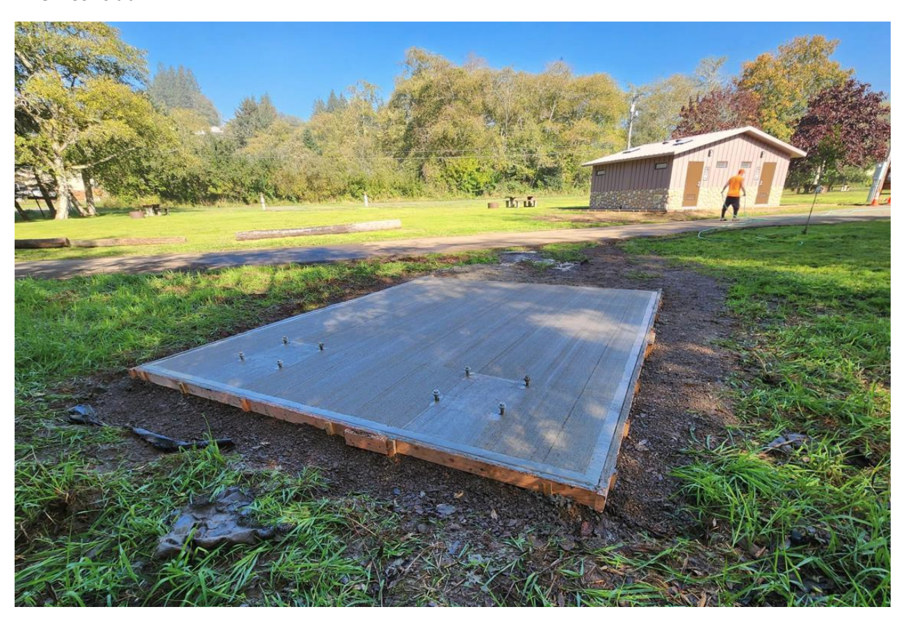
Placing anchor bolts in Bike Kiosk slab for lockers to fit upon