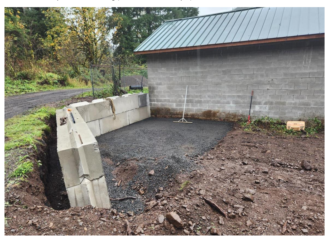
Road base around wells